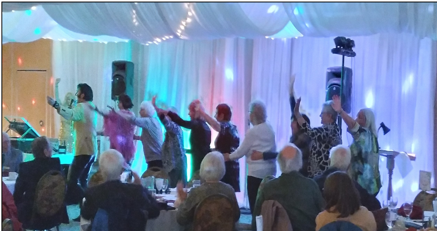
Yes... That is Elvis leading a conga line. What did you expect?