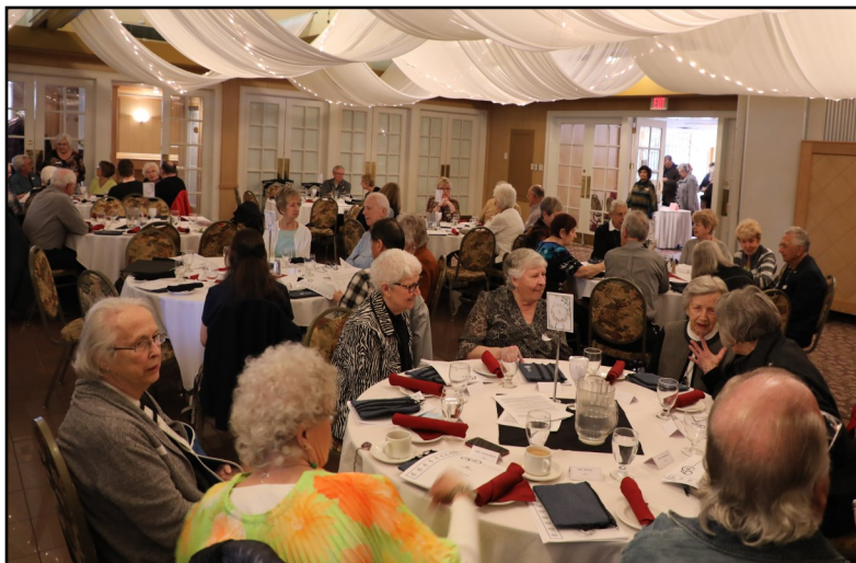
As always, Newlands provided a tasteful venue and a delicious luncheon buffet