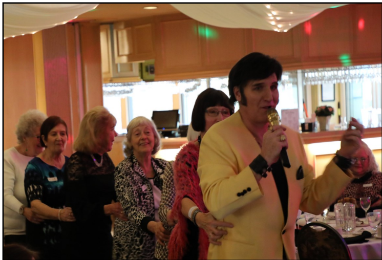
There's that conga line again!