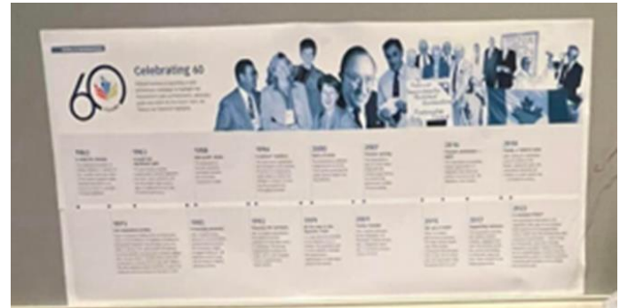
Information posters on NAFR history on the walls around the room