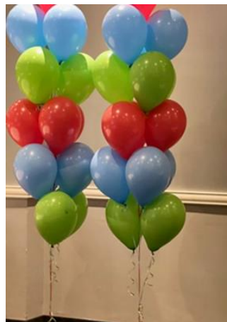
balloon decoration in NAFR colours