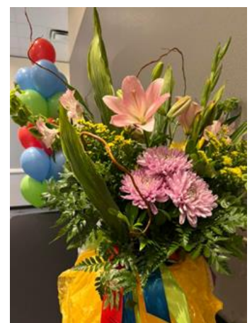
large floral arrangement