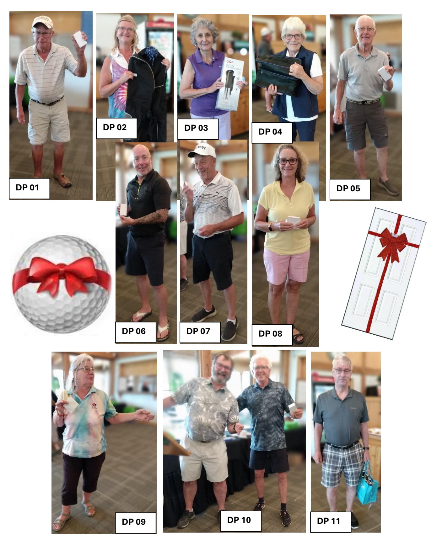
Page 5 of 9