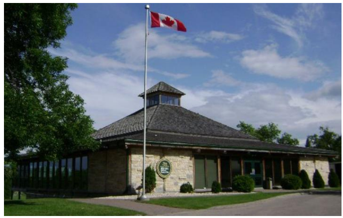
Page 9 of 9