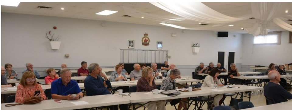
September General Meeting at Royal Canadian Legion