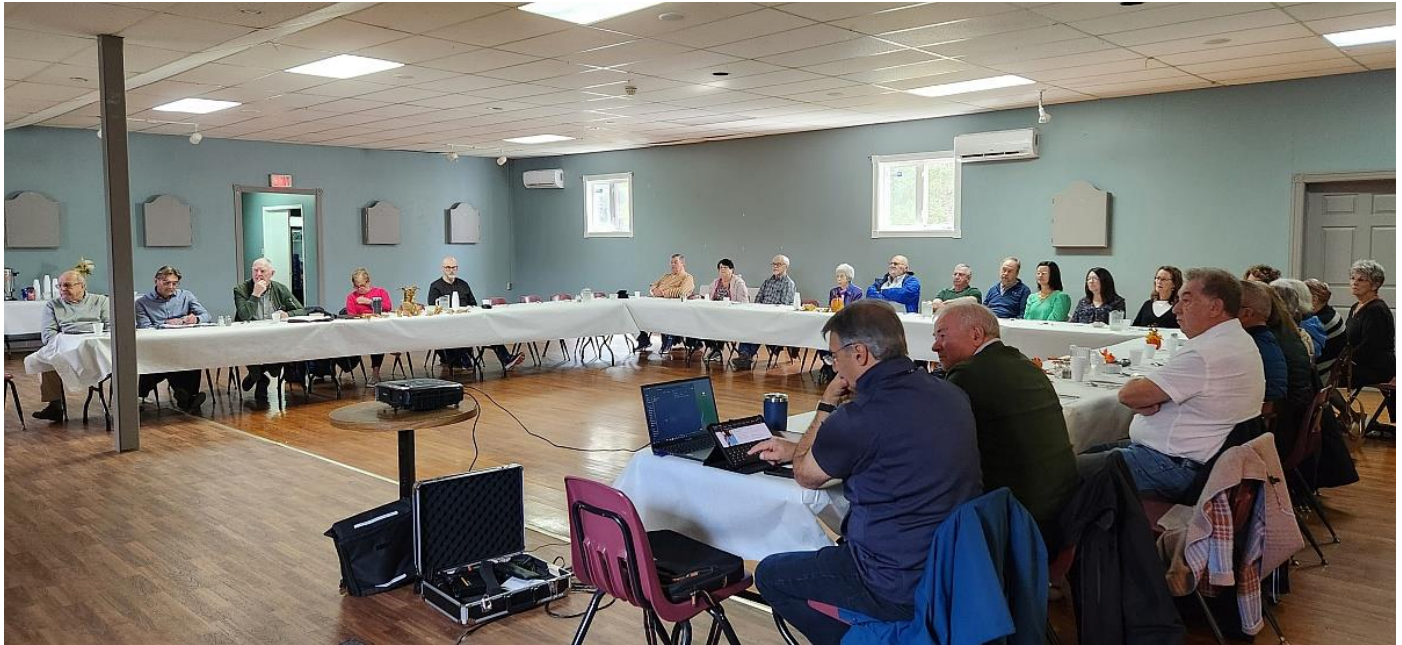
Attendees at the Members' meeting in CBN