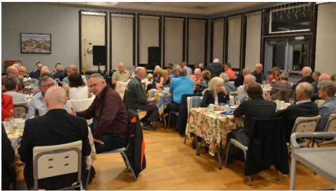
September BBQ at Masonic Hall