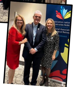
NAFR Outaouais Branch Employees