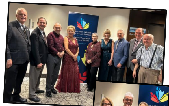
NAFR Outaouais Branch Board of Members